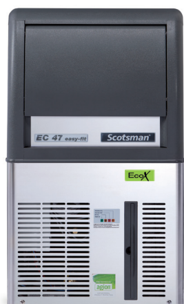
Medium gourmet cube 20g, 30mm dia x H 34mm

ECM 47 AS OX Medium gourmet cube 20g, Ø30mm x 34mm